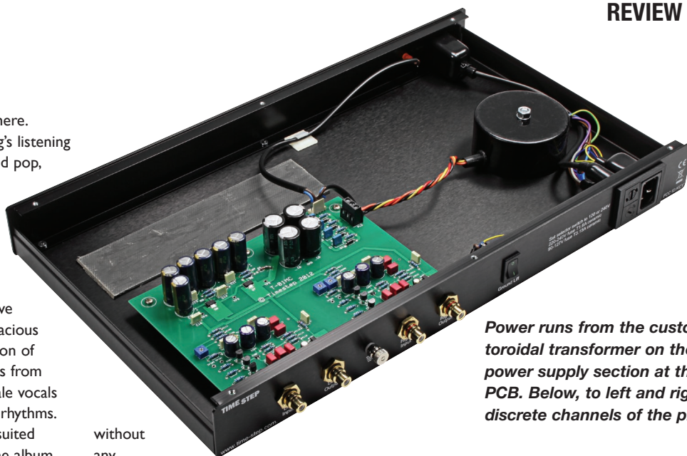
Power runs from the custom wound toroidal transformer on the right, into the power supply section at the top of the PCB. Below, to left and right, are the two discrete channels of the phono stage.

I briefly tried it with the Goldring Legacy cartridge, whose very low output can be a problem for some phonostages. I found that the Timestep's very low noise levels allowed the cartridge to perform well