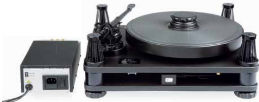
ABOVE: Rear view shows primary power/on off at back of outboard power supply/speed selector. Cable (exiting left) connects to central block at back of the Model 20/3

produced a range that starts out so blissfully competent at its entry level that the benefits proffered by the dearer models are more rarefied. If SME were blessed with a master list of all the high-end amplifiers and speakers on the market, I'm sure that the company would be able to match like with like, eg, a Model 30/12 with Wilson Alexandrias, or a 20/3 with Sophia 3s.